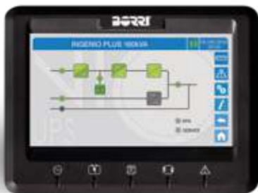
*Optional touch screen display (on 60-160 kW UPS)