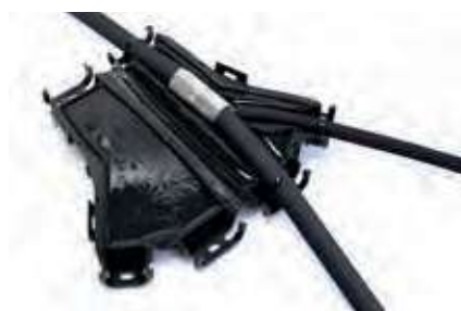
2. Dip connection in the gel and block wires at the ends with the included tie-wraps.