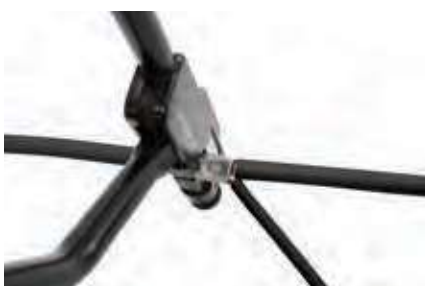
1. Strip and crimp wires.