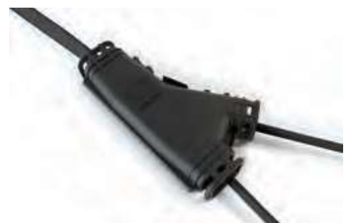
3. Verify clip closing and gel overflowing in wire input/output points in order to guarantee a perfect watertight seal.